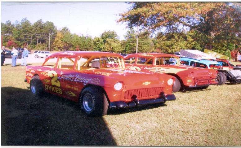
The racing and show '55s at Augusta show