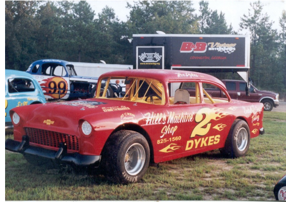
The racing '55 A real competitor