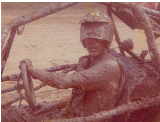
Callaway off-road racing at 21 at the 6 Flags Dune Buggy Track. Why would you ever leave this for stock car racing?