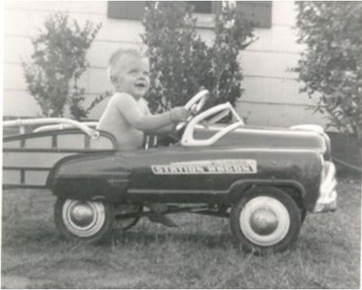
Woody is pedal-to-the-metal at age 2

Woody says he's always run two or three cars driving one of the late models himself with Jason Bowen driving the street stock. (Jason also drives the #16 NVRA Late Model Modified for Sonny Childs.)