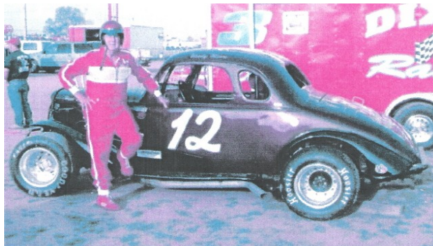
The '37 replica Woody raced with the NVRA

In '59 and Pheonix City (AL) Speedway in '58-'59 (whew!)